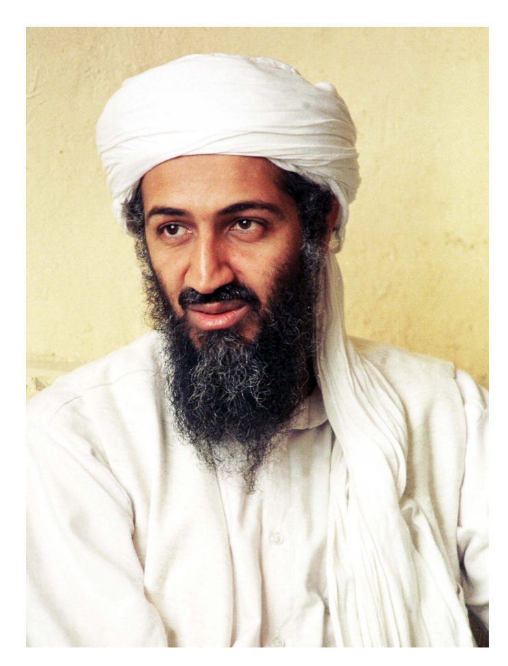
Osama bin Laden