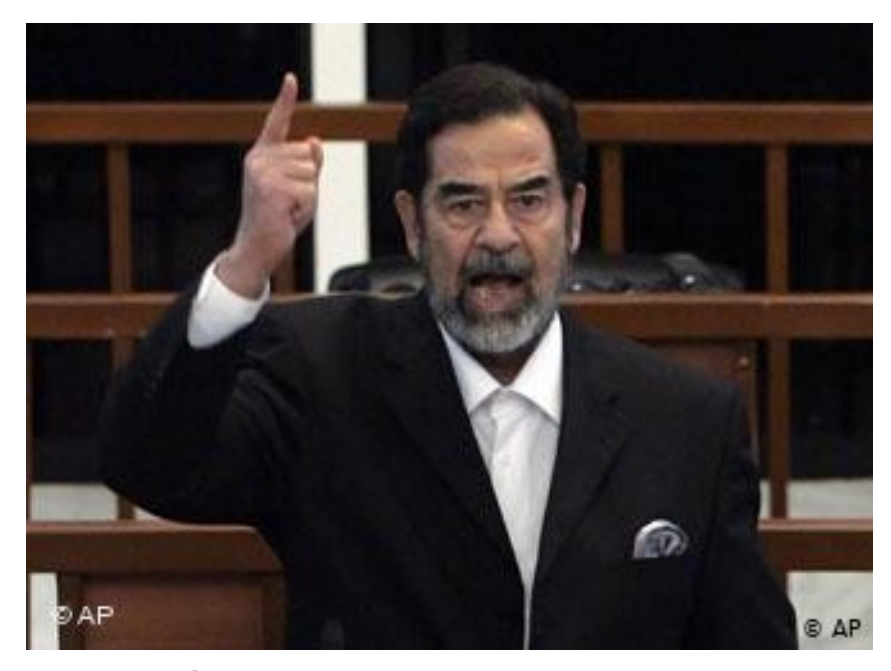
Saddam Hussein in court