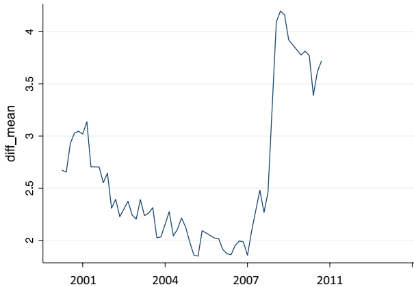
Fig. 2 Elite Polarization (“diff_mean”) trend from 2001 (92nd CBOS survey to 2011 (165th CBOS survey)

leaders of PiS and PO, respectively. The formula describing the polarization measure is