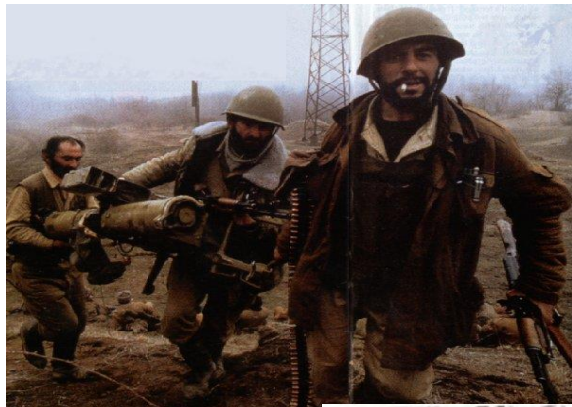
Guerillas in Nagorno-Karabakh.