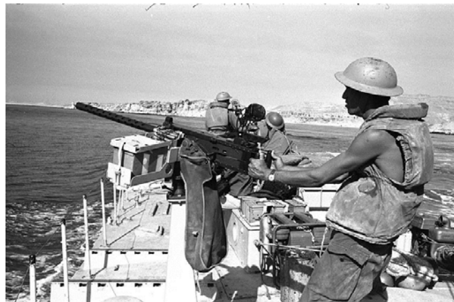
Nasser announced the closure of the Strait of Tiran to Israeli and Israel-bound shipping. Within days of the start of the war, Israeli gunboats passed freely through the straits.

The die was cast. Having maneuvered himself yet again into the driver's seat of inter-Arab politics, Nasser could not climb down without risking a tremendous loss of face. He was approaching the brink with open eyes, and if there was no way out of the crisis other than war, so be it: Egypt was prepared. Daily consultations between the political and the military leaderships were held. The Egyptian forces in Sinai were assigned their