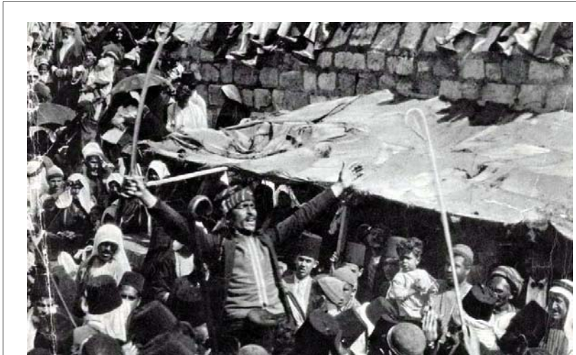
Pan-Arab nationalists carried out a pogrom in Jerusalem in 1920, killing five Jews and wounding 211. In 1921, Arab riots claimed 90 dead with hundreds wounded. In 1929, more violence resulted in the death of 133 Jews and the wounding of hundreds more.

For me, you may be a fact, but for [the Arab masses], you are not a fact at all—you are a temporary phenomenon. Centuries ago, the Crusaders established themselves in our