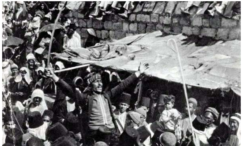
Pan-Arab nationalists carried out a pogrom in Jerusalem in 1920, killing five Jews and wounding 211. In 1921, Arab riots claimed 90 dead with hundreds wounded. In 1929, more violence resulted in the death of 133 Jews and the wounding of hundreds more.

For me, you may be a fact, but for [the Arab masses], you are not a fact at all—you are a temporary phenomenon. Centuries ago, the Crusaders established themselves in our