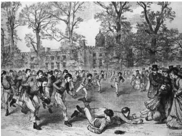
Picture 2. Rugby College, where Rugby football originated, became a mythical place. Pierre de Coubertin ‘sanctified’ Thomas Arnold, the headmaster of Rugby College, as the ‘father of modern sport’. Drawing by W. Thomas, 1870.

Also, the principle of handicapping in sports such as horse racing and golf, and even in tennis, was introduced to ensure an equilibrium of chances between competitors of different weight categories or of different skill levels. The origin of the term stems not from hand in cape or hand on cap , as is often said, but from hand in cap . Originally, hand in cap was the name of a trading game, involving two traders and an umpire or matchmaker. A typical 14 th century example could include the trade of a cloak for a hood. The matchmaker decides on the difference in value ( boot or odds ) between the two items to be traded. Both traders put their hands into a cap, and would draw them out at the same time. An open hand was an agreement to trade and a closed hand was a refusal to trade. In around 1750, the term handicap began to apply to horse races ( The Oxford English Dictionary , 1989; Crowley & Crowley 1999).