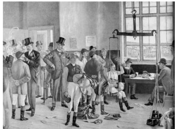
Picture 3. The principle of 'handicapping' was introduced in horse racing - and other sports - to ensure equilibrium of chances between competitors of different weight categories. This picture of "The weighing room", where jockeys are 'matched', appeared in the Illustrated London News of 1893.