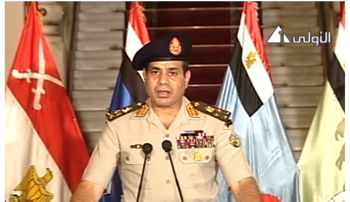
Abdel Fattah el-Sisi