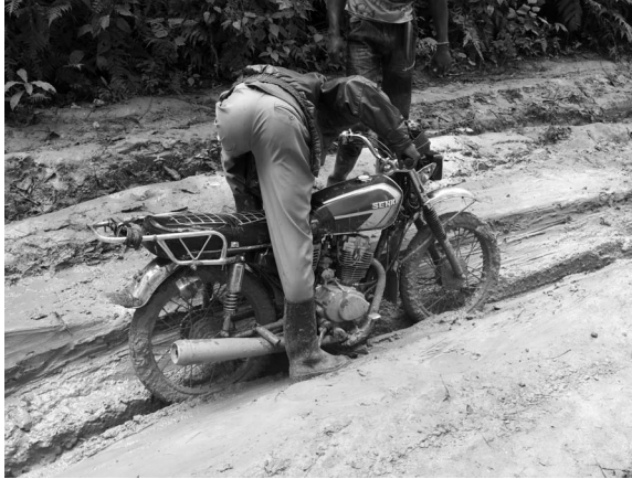
Figure 3. Navigating Decrepit Infrastructure.

Source: Picture taken by author, Ituri (DRC), November 2011.