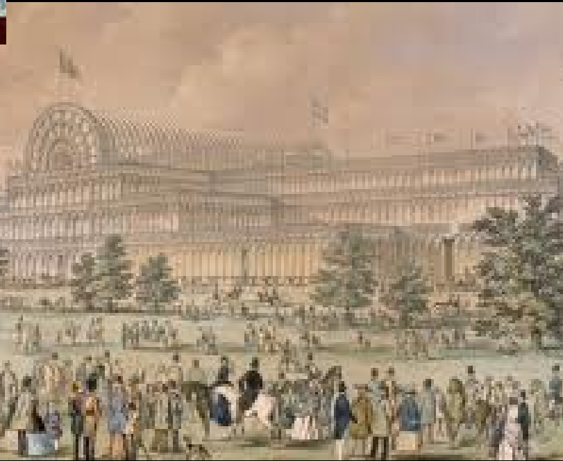
Crystal Palace London great exhibition, 1851