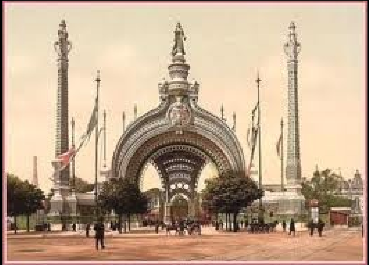
Entrance to 1900, exposition, Paris

Les expositions nationales et universelles; 1844, 1855, 1867, 1889, 1900