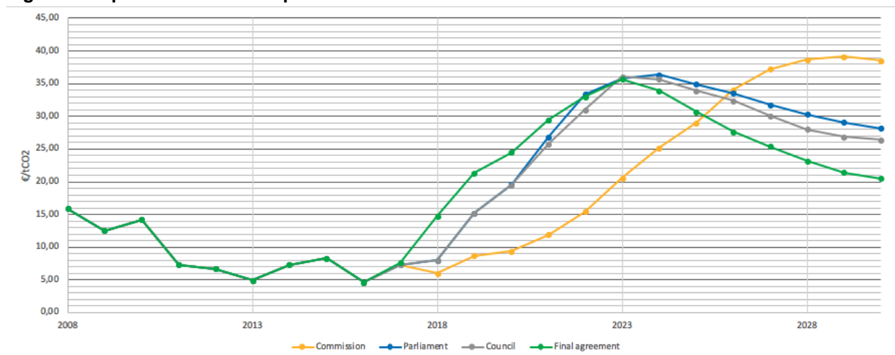
Figure 3: Impact of the EU ETS phase IV reform

As a result of these improvements, the EU ETS is expected to perform better in the coming phase and to deliver a stronger price signal to covered entities. A modelling of the impact of the EU ETS phase IV reform was carried out by carbon market analyst firm ICIS and is shown in the graph below.