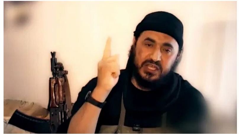
Abu Musab al-Zarqawi