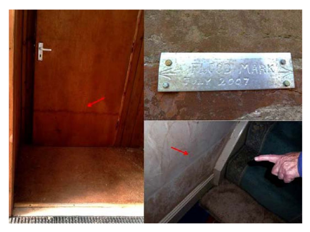
Figure 4. Unofficial flood marks of residents inside and outside their homes and gardens.