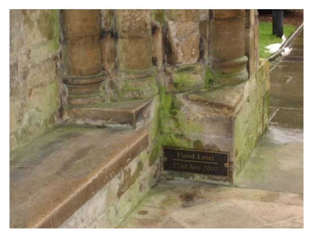
Figure 3. Setting I Abbey Flood Level 2007 Official Mark. Dated 22 July 2007.

anecdotes, hard copy/digital photographs, collections of maps, scrapbooks, virtual (online) collections, and repeated or painful memories (see Figure 6).