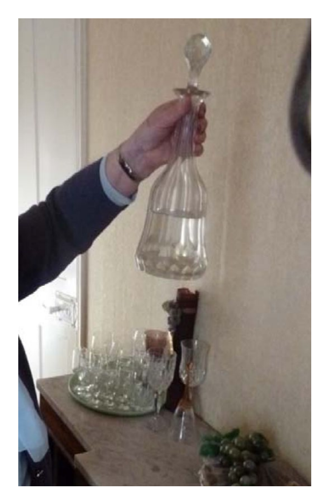
Figure 2. Floodwater in a decanter.