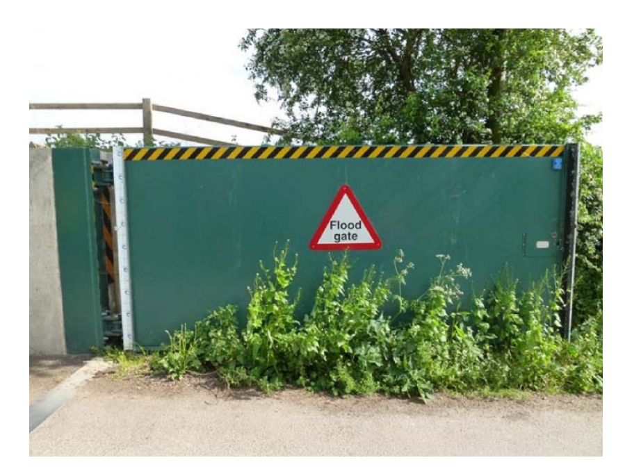
Figure 5. Photo of a flood defence system implemented after the 2007 floods. Source: Joanne Garde-Hansen. Published with permission.

Figure 4. Unofficial flood marks of residents inside and outside their homes and gardens. Source: Andrew Holmes and Lindsey McEwen. Published with permission.