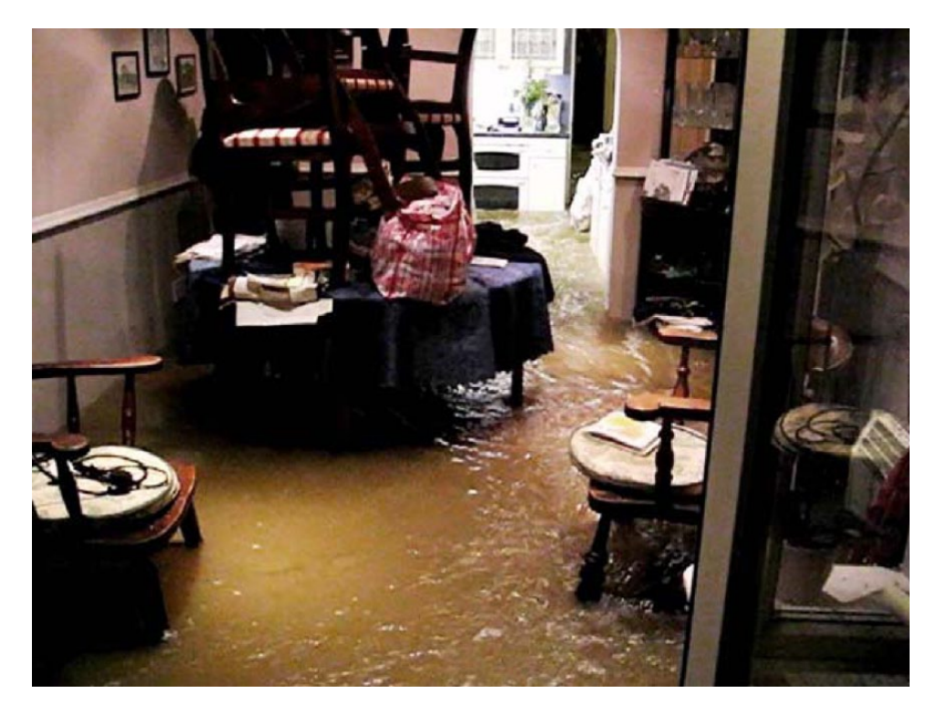
Figure 6. Screen capture from a home video, July 2007: floodwater surges through the kitchen and living room of his (Setting 1) house.

approached the paradigm shift towards resilience through a traditional marketing and communications perspective (R&D Project W5-024, 2005). It recognised the need to profile different target audiences in terms of flood awareness, probability and history; the need to define the communication objectives in line with the value systems and perceptions of those different audiences; and to establish the communication mix and channels for delivering different message components. From a media and communication studies perspective, this framework conceptualises flood risk as environmental event content and the community as an audience in broadcast terms. Such a framework presents a number of key questions about FRM in the twenty first century. What are the value systems and perceptions in mixed communities along a floodplain and how might they have been materialised over centuries (not just in the recent past)? What would be the best channels for exchanging messages of flood awareness, probability and history in a mixed-media culture where community members are not passive consumers of information but actively living with water? How are communication repertoires incorporating new methods of engagement with flood risk communities already engaged in diverse practices of personal, collective, social, cultural, archival and materialised flood memory?