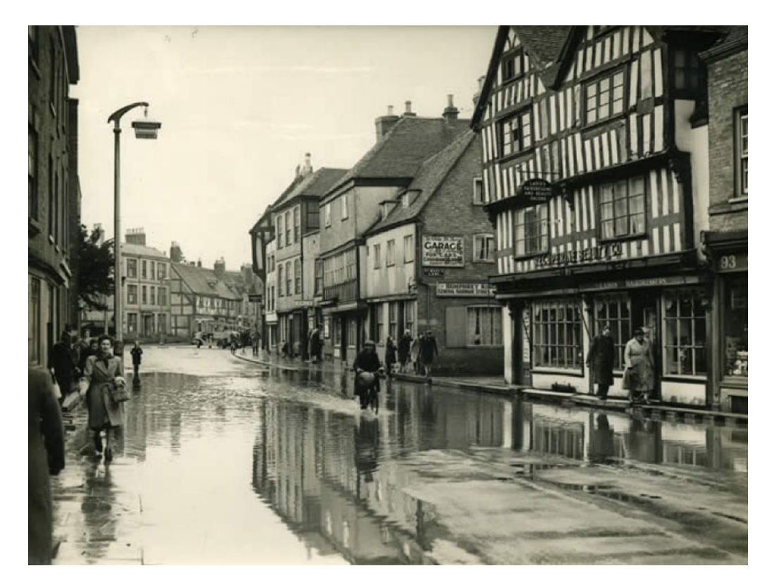
Figure 1. A photograph of the 1947 floods in (Setting 1). Source: Gloucestershire Echo . Published with permission.

photographs connecting both events. They were being connected in terms of a collective memory to reinforce a 'Blitz spirit'. Many of our interviewees, mentioned the war as an important marker of British resilience to flood disaster. This historical connectivity, neglected living with water as a continuous activity, and produced the flood narrative in terms of national identity that conjoined extreme weather and war: