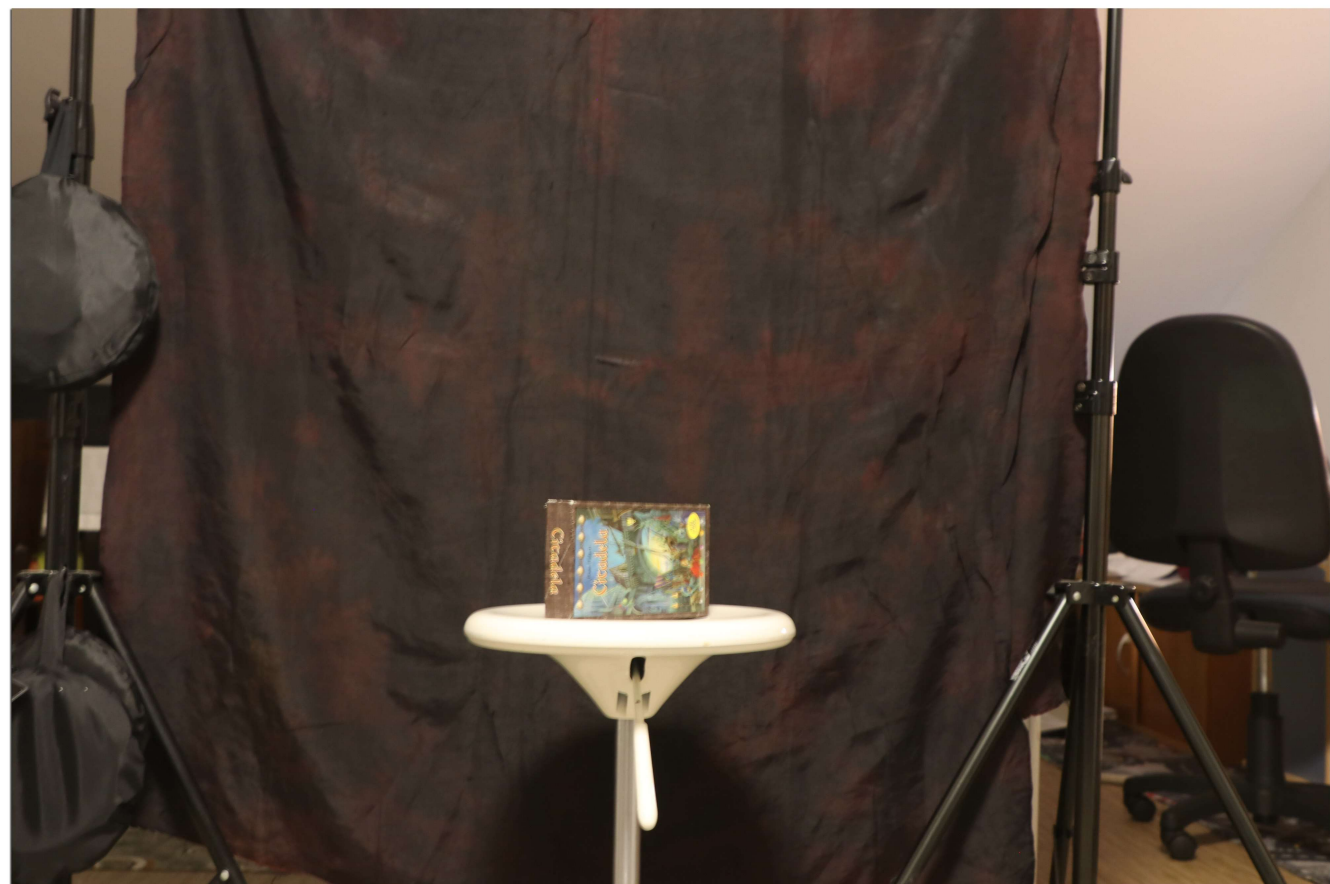
Love was such an easy game to play.