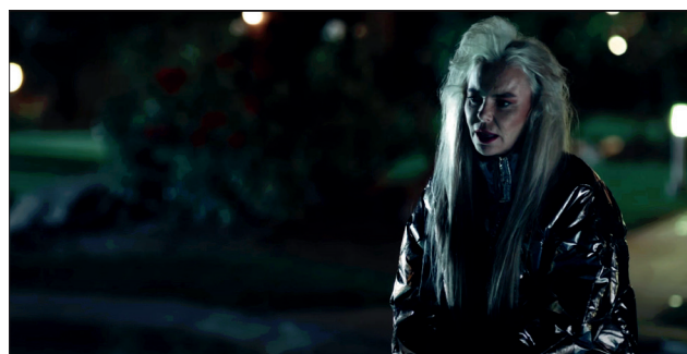
Images 2, 3, 4 and 5. Stills from Stranger Things promotional videos in Brazil, Mexico, Colombia and Spain.

According to Parulekar and Krishnan (2018) , the aim is to “create demand” for original content, to which end the creative and technology departments work hand in hand. Promoting Netflix Originals in so many languages, with different concepts and messages, involves millions of marketing elements, a process that is largely automated and involves large-scale campaigns adapted to different territories.