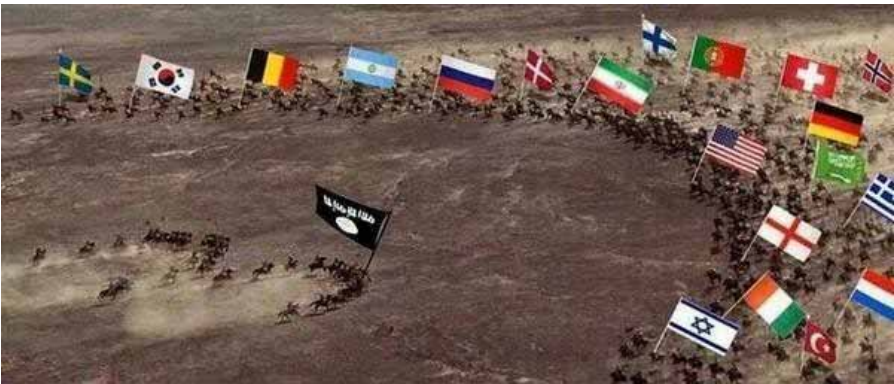
IMAGE 13.1. Imaginary view of the final battle, according to Islamic State. 1

In this perspective, the present paper specifies the narrative of IS. To do so, it sets out to deconstruct the geopolitical imaginary of IS, referring to the speeches and statements of its leadership as well as its various propaganda documents (for example maps and pictures, as seen in Image 13.1.). Understanding this imaginary is not only bound up with grasping the movement's interpretation of the sources it quotes, but is also the key to better understanding its eschatological agenda and its seductive appeal for the young people prepared to join the jihad – as well as, ultimately, providing the necessary basis on which a counter-narrative can be built.