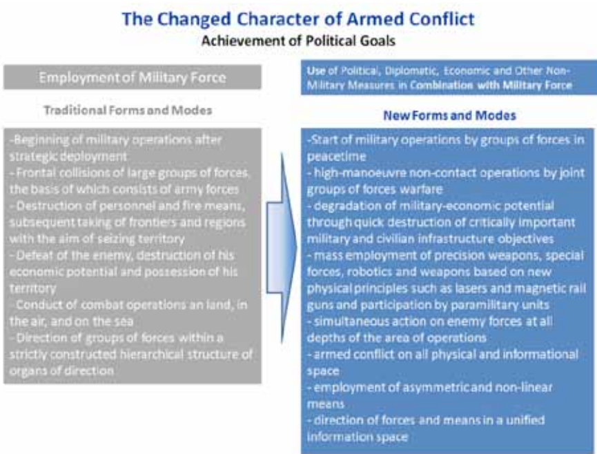
FIGURE 8.2. Illustration on Characteristics of modern conflict accompanying General Gerasimov's remarks to the Russian Academy of Military Science. 34

General Staff analysts subsequently elaborated a range of features of military actions, which appear to relate mostly to non-linear/hybrid means and are highly congruent with Russian approaches used in Ukraine, including: