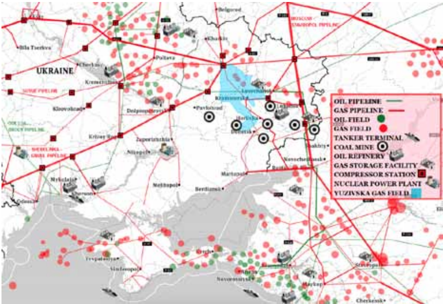
MAP 10.1. Eastern Ukraine's energy infrastructure map. 3

With regard to the Donbass region, energy plays an even more important role. The region is rich in energy resources and infrastructure: it produces 90 percent of Ukraine's coal, has both conventional and unconventional gas fields (including the massive "Yuzivska" shale gas deposit area), several underground gas storage sites, and transit pipelines. As a result, by losing control over this region, Kiev became even more dependent on imported energy. In addition, some of the energy infrastructure located in the Donbass region is of particular strategic importance to Russia. Gas pipeline