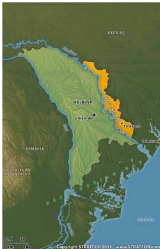
MAP 11.1. The Republic of Moldova's Transnistrian region. 2