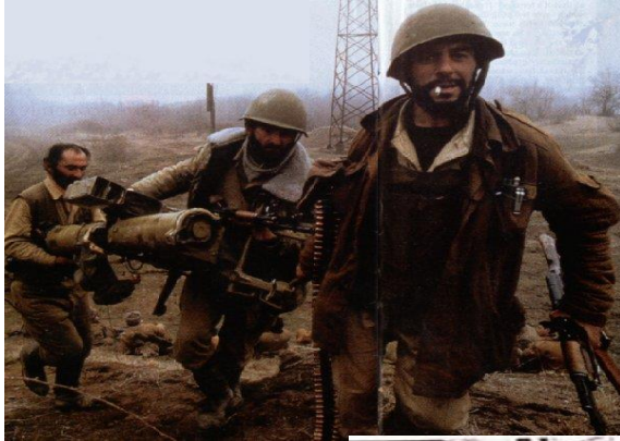
Guerillas in Nagorno-Karabakh.