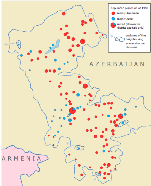
ETHNIC COMPOSITION OF THE NAGORNO-KARABAKH AUTONOMOUS OBLAST IN 1989