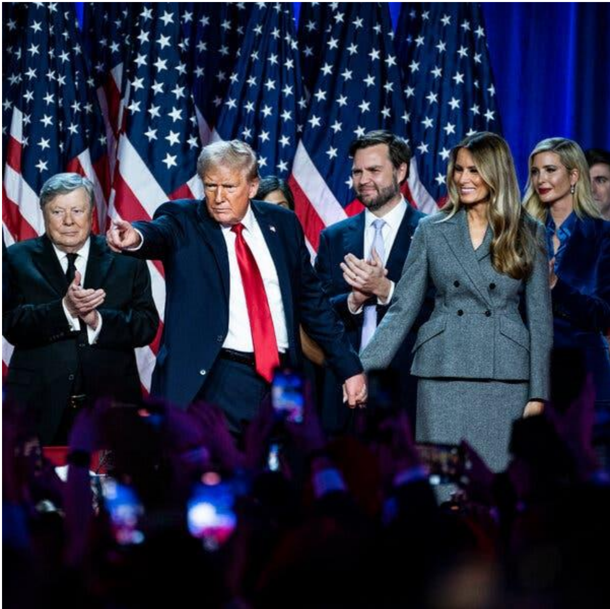
President-elect Donald J. Trump at his election night party.

Covid cost Trump the presidency in 2020, and it may have cleared the path for his return.