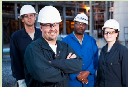
6. Vicarious liability