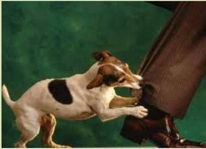
1. Strict liability