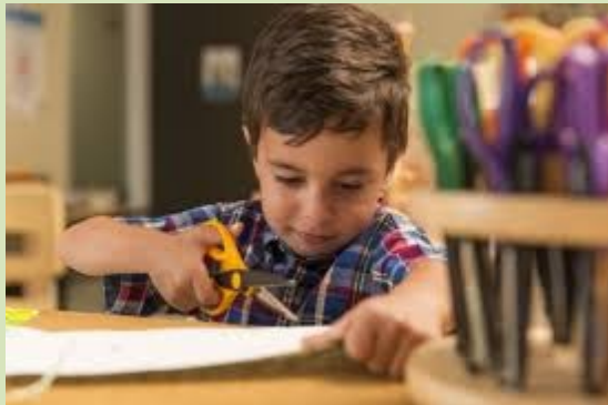
5. Foreseeable harm