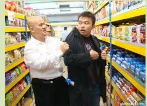
3. False imprisonment