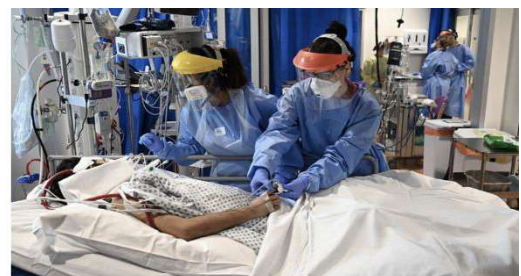
Hospital beds filling up in the ICU as staff work to treat COVID Patients

Severely ill COVID-22 patients have begun to fill up hospital beds by the masses with a substantial admissions spike recorded on the 7 th April. Health care workers are bracing for further influxes of patients in the wake of skyrocketing COVID infections. As of Wednesday, nearly 42,000 COVID-22 patients were hospitalized across the country.