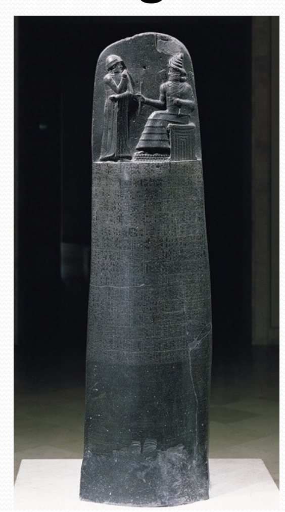
Code on diorite stele