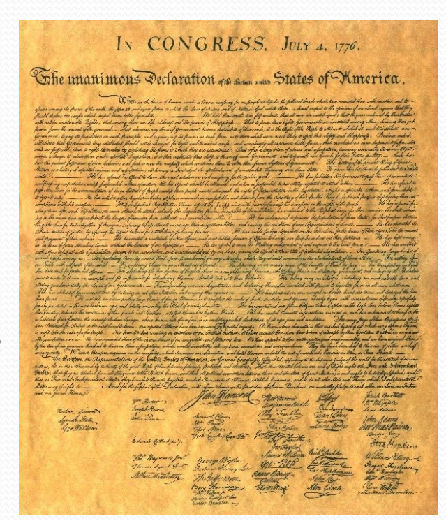
Declaration of Independence