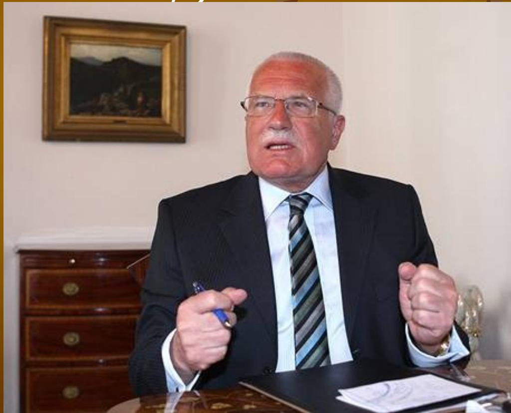
Human Rights in a Comparative Perspective 3 - New level of protection