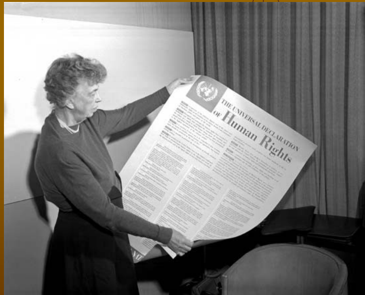
Human Rights in a Comparative Perspective 2 - Levels of protection