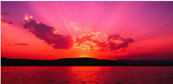
Surface and ground waters are "res nullius"