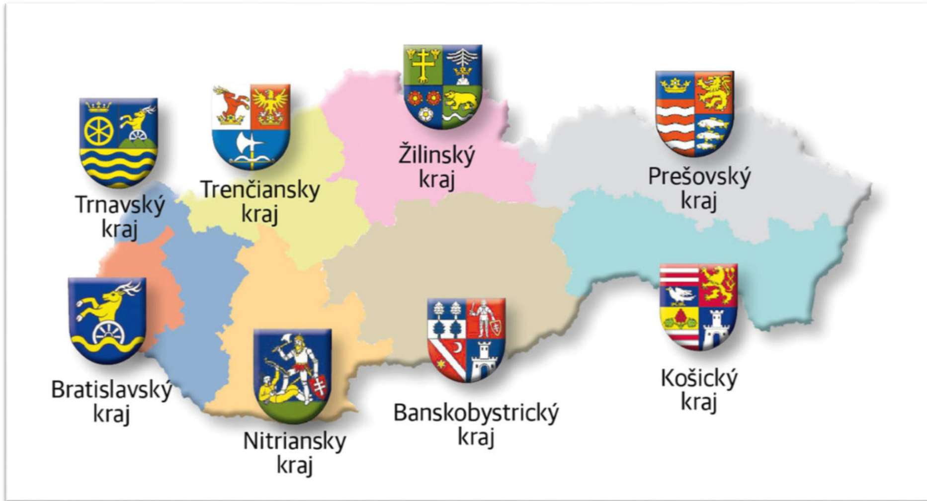
Higher territorial units in Slovakia