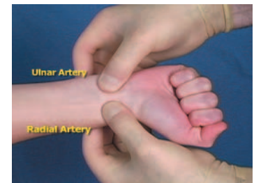
Performance of the Allen test.