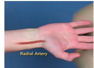
Location of the radial artery.

N Engl J Med 2006;354:e13.