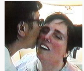
Terri Schiavo with her mother, in 2001