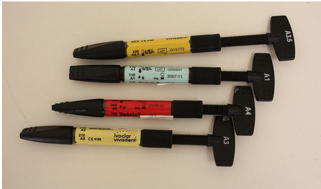
Fig. 1: Dental composites

Resin composite fillings are made of a ceramic and plastic compound. Please perform composition of these materials better: