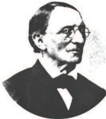
Carl Ludwig (1816 - 1895) - a pioneer of renal physiology.