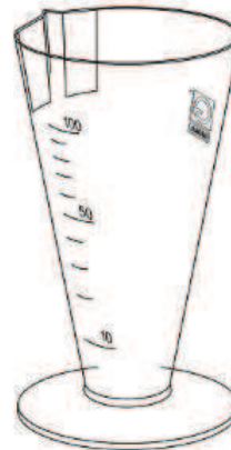
Urine collection container

Refractometer, urine collection container, urine transfer pipette to refractometer, test strips, measuring container and paper napkins.