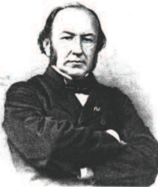
Claude Bernard (1813 - 1867) - the first to express the concept of the constancy of the internal environment.