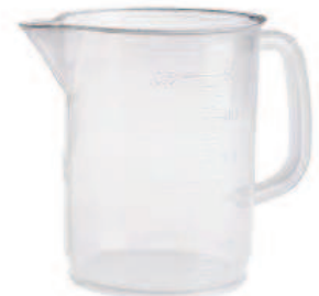
Urine measuring container