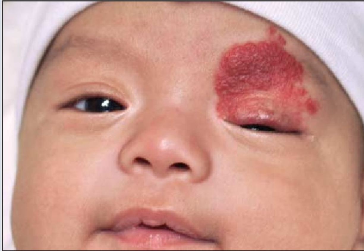
Figure 1. Before topical treatment, a large capillary hemangioma involved