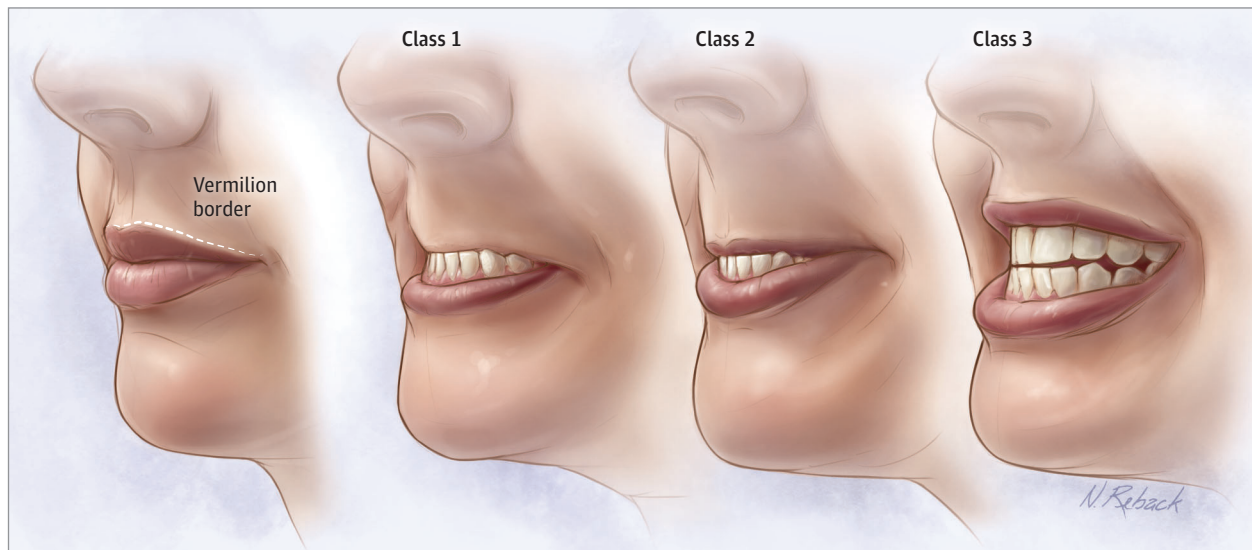
Figure 1. Upper Lip Bite Test

The upper lip bite test is performed by asking patients to bite their upper lip with their lower incisors. The results are classified as follows: class 1, the lower incisors extend beyond the vermilion border of the upper lip; class 2, the lower