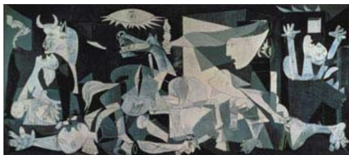
Name: Guernica Artist: Picasso Date: 1937 Materials: Oil Paints