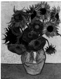
Name: Sunflowers Artist: Van Gogh Date: 1889 Materials: Oil Paints