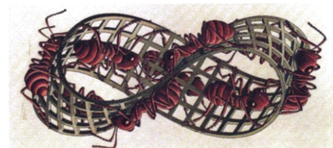
Name: Mobius Strip