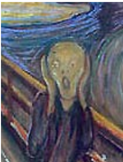
Name: The Scream