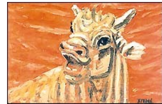
Name: The Ox