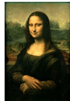
Name: Mona Lisa