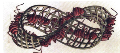
Name: Möbius Strip Artist: Date: Materials: