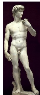
Name: David Artist: Michelangelo Date: 1501-1504 Materials: Marble