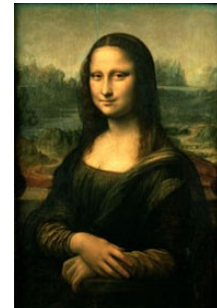
Name: Mona Lisa Artist: Date: Materials: