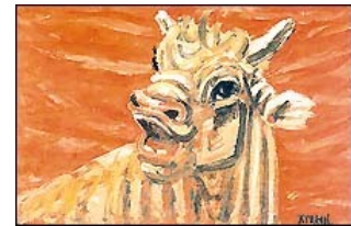
Name: The Ox Artist: Joong-sup Lee Date: In the 1950s Materials: Oil paints