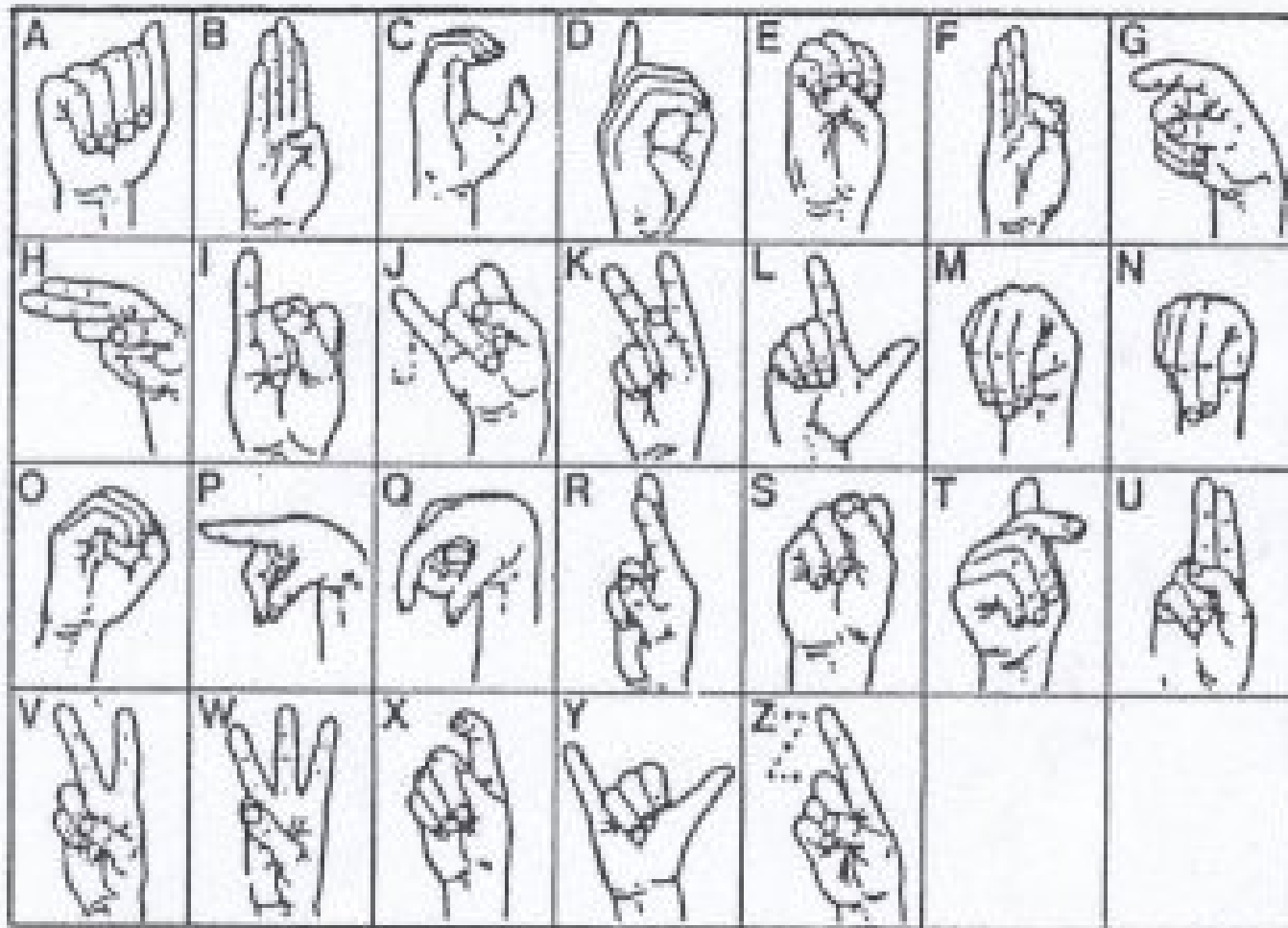
obr. 6: Mezinárodní prstová abeceda

Ask for your colleague: „May I measure your blood