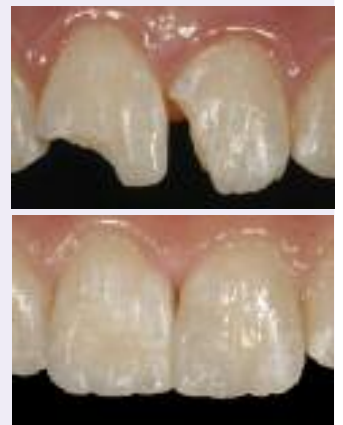
Clinical case by Lorenzo Vanini