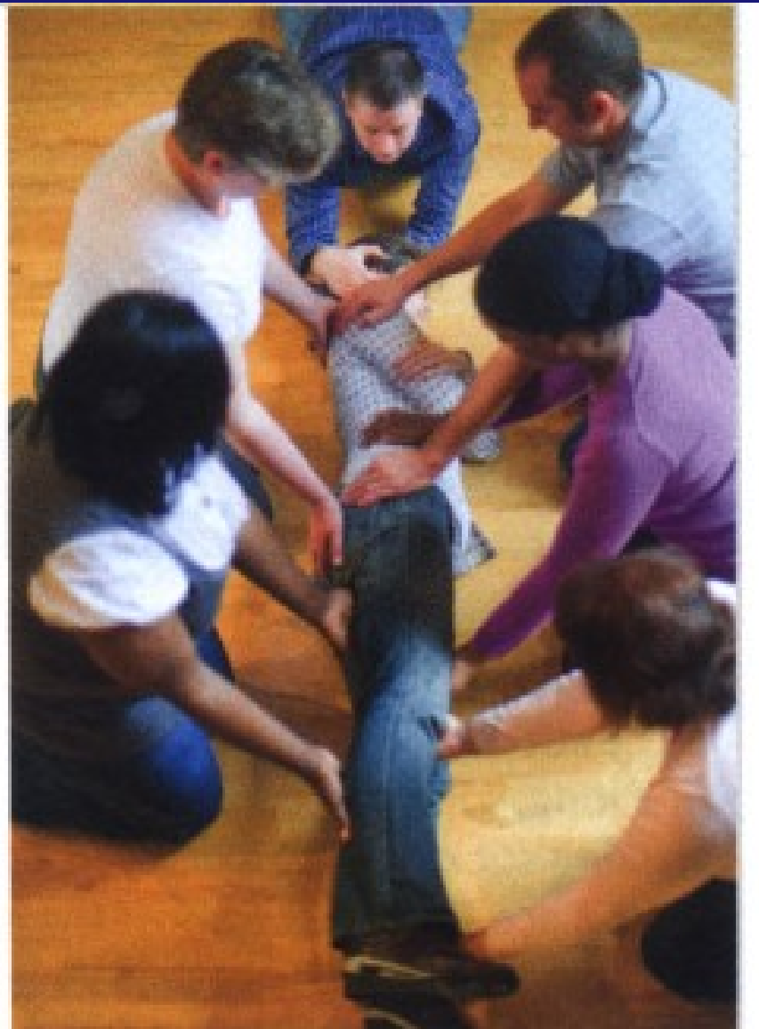
Log- roll technique