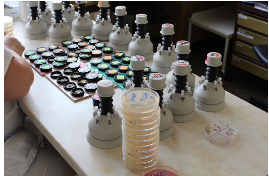
inoculation of suspension into Muller-Hinton agar