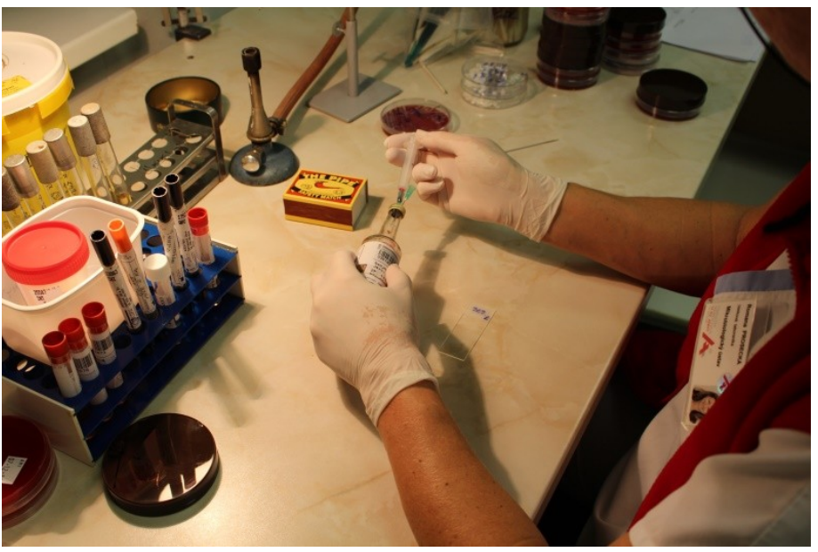
microscopy sample preparation