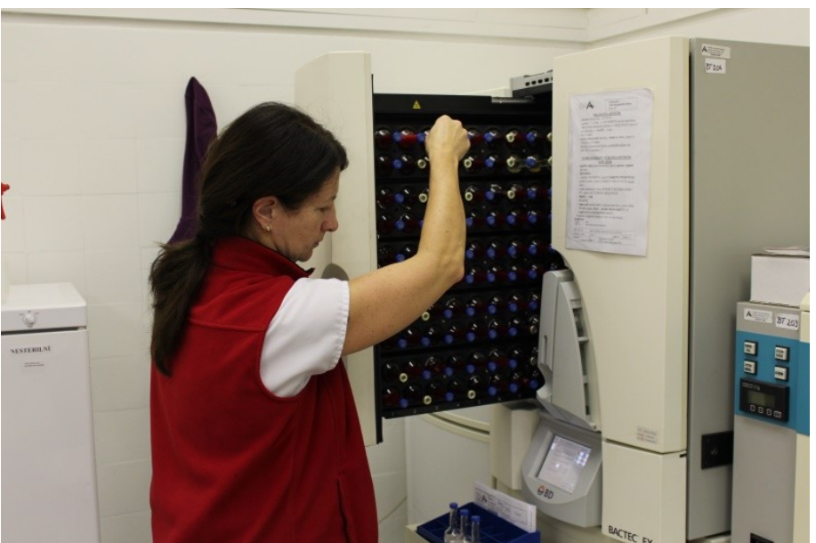
Inserting samples into Blood culture device