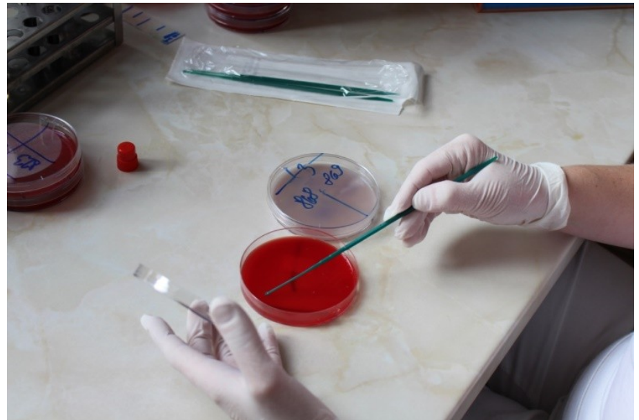
sample inoculating by calibrated loop