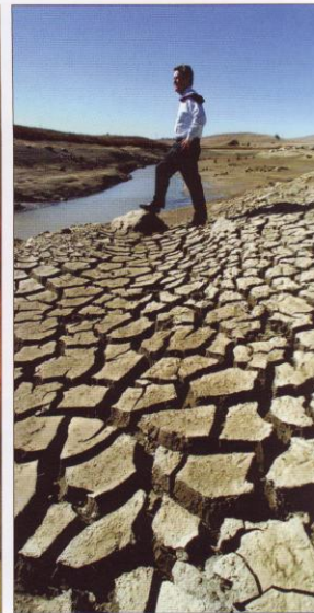
▲ The Mayor of Goulburn, NSW, surveys the water levels at Pejar Dam in April 2006. For the past few years the people of Goulburn, one of Australia's most drought-affected cities, have been watching the water levels in their city dam drop lower and lower.