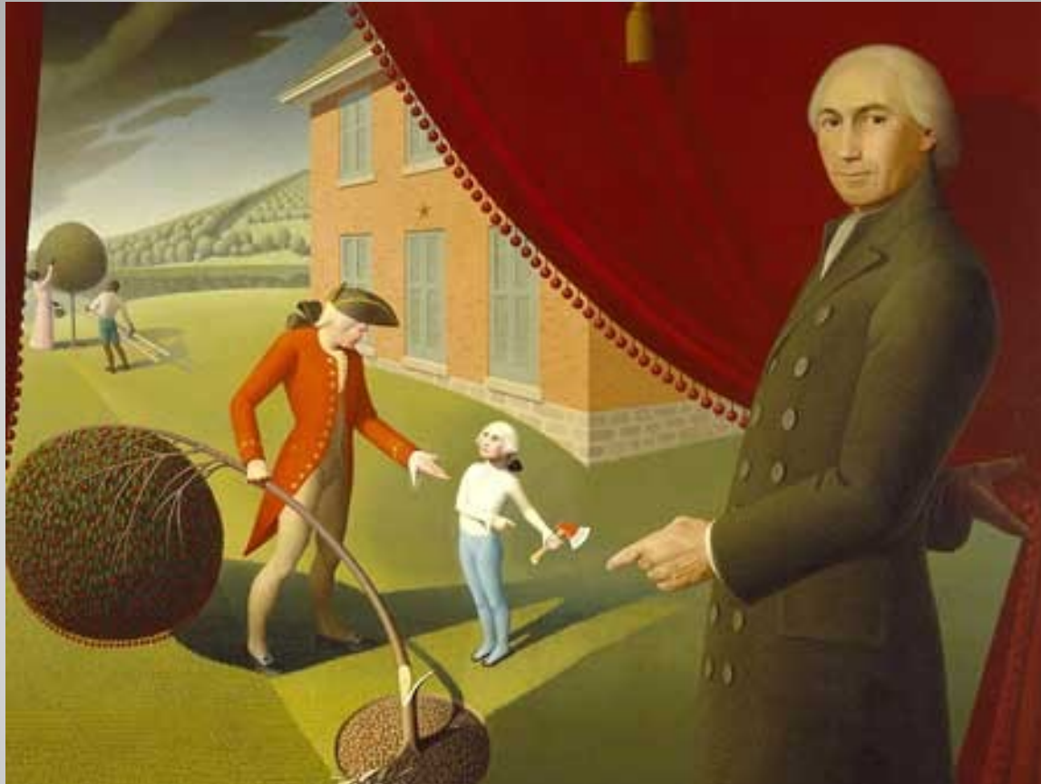
Parson Weems' Fable (Grant Wood, 1939)