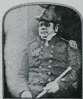
CAPT. SIR JOHN FRANKLIN.