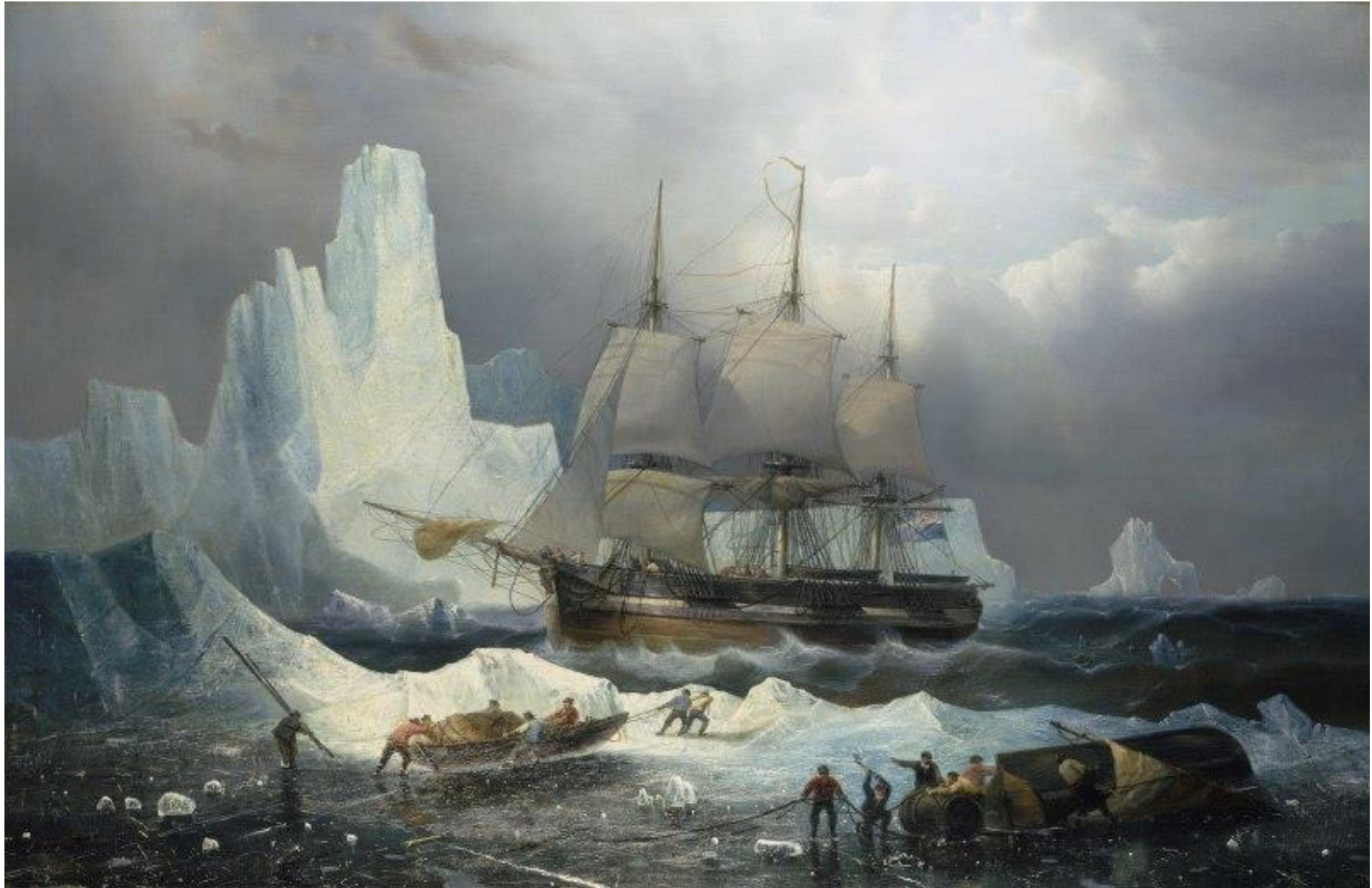
HMS Erebus in the ice