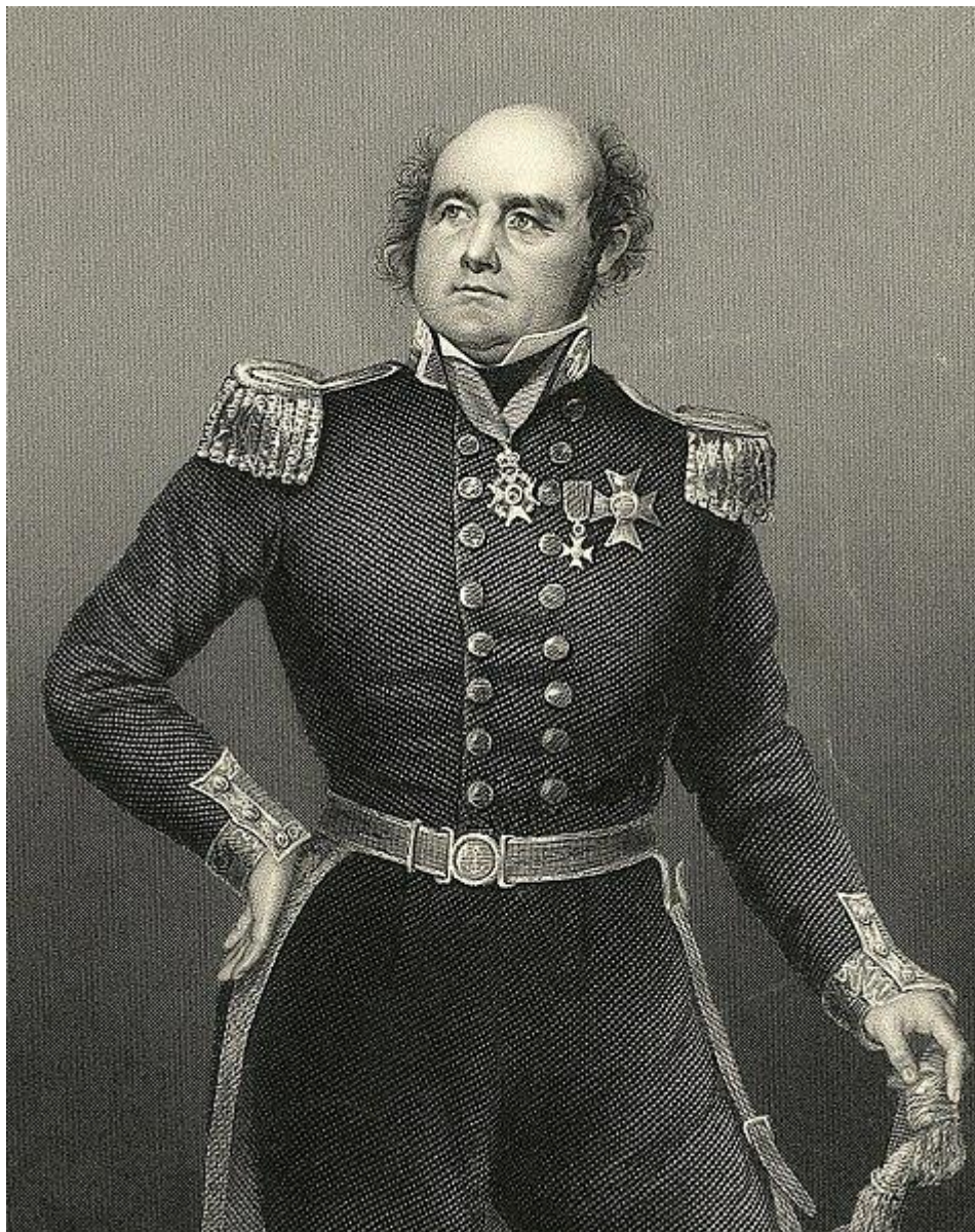
Sir John Franklin, the leader of your expedition

Given under our hands, this 5th day of May 1845.