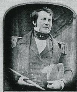
COM. FITZJAMES. (CAPT. "EREBUS")