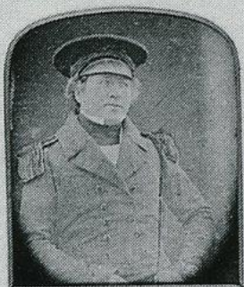
CAPT. CROZIER. ("TERROR")