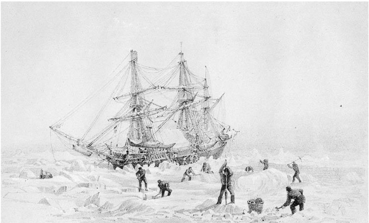
HMS Terror in the Arctic