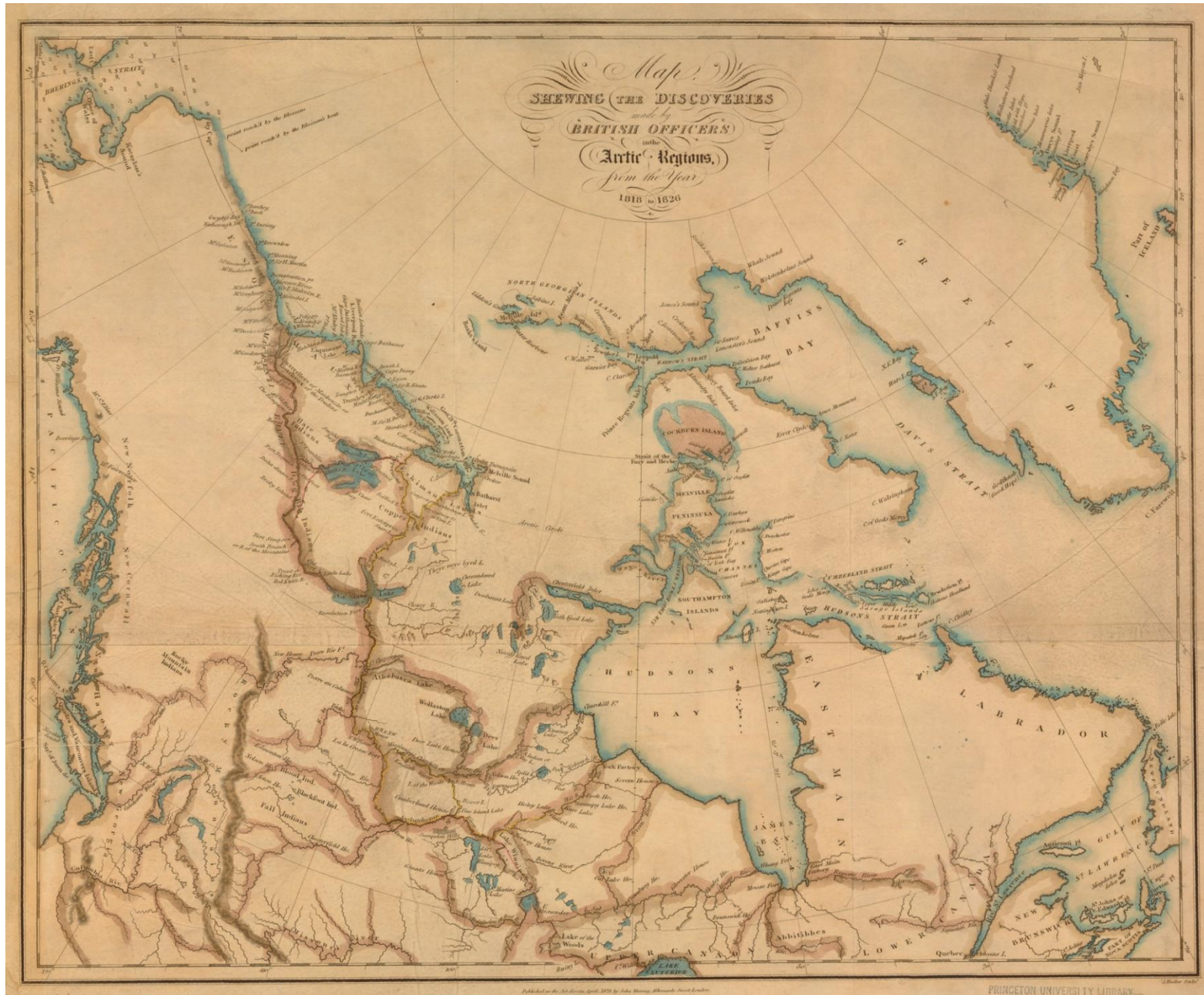
The Map of The Arctic around 1920