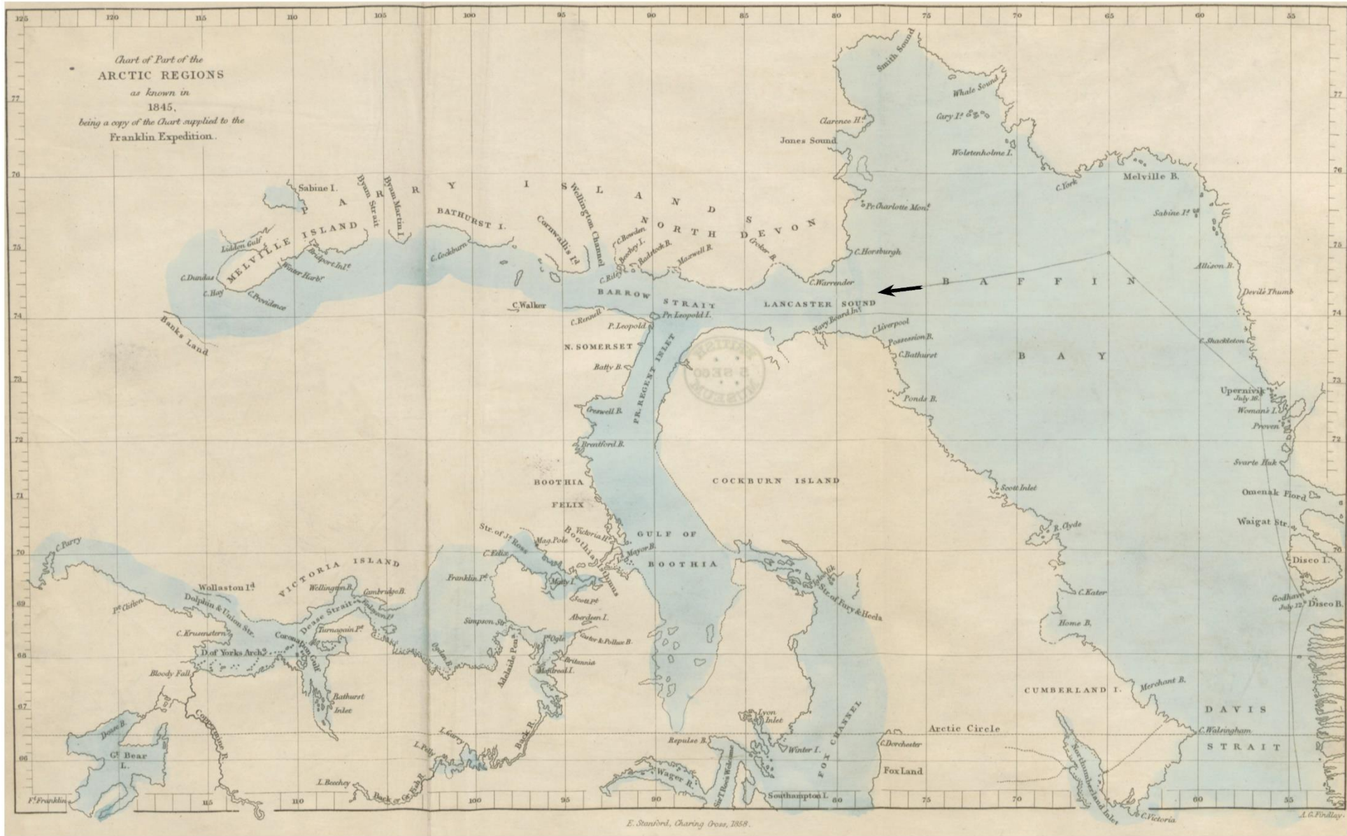
The Arctic regions as known to you, with uncharted territory to be explored