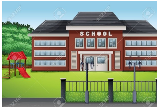
The Yellow Elementary school

The Yellow Elementary School is located in the centre of the town in a three-storey building from year 1916. The school is equipped with gym and computer science classrooms in the first floor. Primary school classes are located on the third floor and the junior secondary school classes are on the 2nd floor. The classes are equipped with interactive boards and projectors.