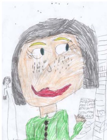
Children's Drawing #3

Growth in the hemispheres and corpus callosum: Between ages three and six, both the left and right hemispheres of the brain grow dramatically. The left side of the brain or hemisphere is typically involved in language skills. The right hemisphere continues to grow throughout early childhood and is involved in tasks that require spatial skills such as recognizing shapes and patterns. The corpus callosum which connects the two hemispheres of the brain undergoes a growth spurt between ages three and six as well and results in improved coordination between right and left hemisphere tasks. (I once saw a five year old hopping on one foot, rubbing his stomach and patting his head all at the same time. I asked him what he was doing and he replied, "My teacher said this would help my corpus callosum!" Apparently, his kindergarten teacher had explained the process!)