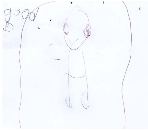
Children's Drawing #2

At age three, the child begins to draw wispy creatures with heads and not much other detail. Gradually pictures begin to have more detail and incorporate more parts of the body. Arm buds become arms and faces take on noses, lips and eventually eyelashes. Look for drawings that you or your child has created to see this fascinating trend. Here are some examples of pictures drawn by my daughters from ages two to seven years.