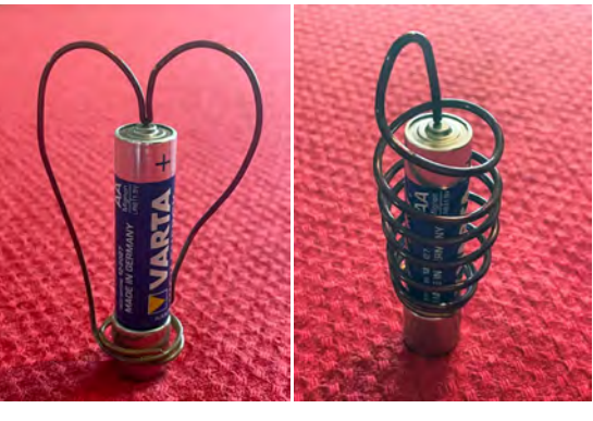
A battery and a copper wire are used to demonstrate the Lorentz force.