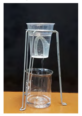
The Pythagoras' cup demonstrating the syphon principle