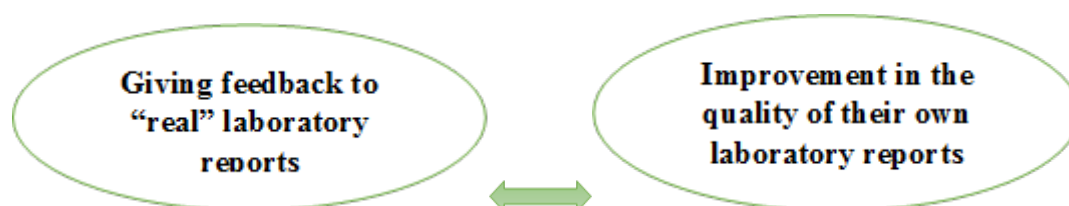
Figure 2. Interaction between giving feedback to student lab reports and improvement of lab reports.

The assessment criteria have been developed during the semester. Through practice and by time, they can give detailed feedback.