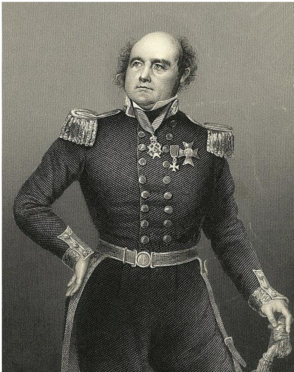
Sir John Franklin, the leader of your expedition

Given under our hands, this 5th day of May 1845.