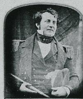
COM. FITZJAMES. (CAPT. "EREBUS")