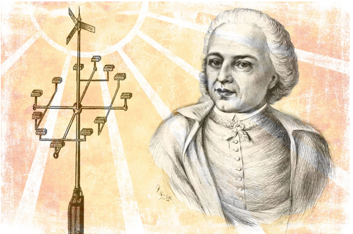
Václav Prokop Diviš