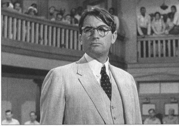
Gregory Peck as Atticus Finch in To Kill a Mockingbird (dir. Robert Mulligan; Universal, 1962)

stroll to one end of the porch and back before he says to her, “First of all . . . if you can learn a simple trick, Scout, you’ll get along a lot better with all kinds of folks. You never really understand a person until you consider things from his point of view . . . until you climb into his skin and walk around in it” (30). This quells Scout’s rage for a moment, but when she affirms that she still doesn’t want to go to school and that it’s not fair that Burris Ewell doesn’t have to go but she does, he replies, “You can’t do that, Scout . . . Sometimes it’s better to bend the law a little in special cases. In your case, the law remains rigid. So to school you must go” (30).