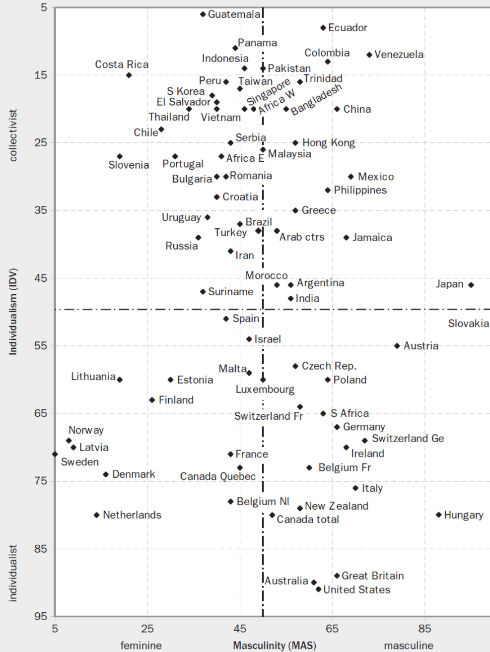
FIGURE 5.1 Masculinity Versus Individualism

Hofstede, G., Hofstede, G. J., & Minkov, M. (2010). Cultures and organizations: Software of the mind: Intercultural cooperation and its importance for survival (3rd). New York: McGraw-Hill. p. 147