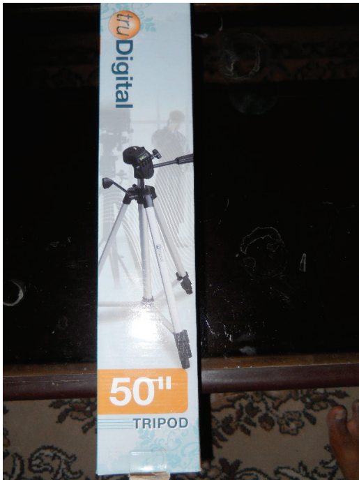
Figure 4: 'Digital' camera tripod.