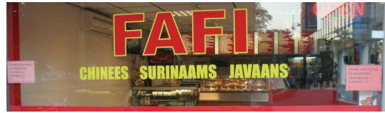
Figure 2: Popular take-away restaurant in Rotterdam, echoing an episode from 19th-century Dutch colonial history, when members of the Chinese minority living in Java (Indonesia, then a Dutch colony) were brought as contract workers to a government-run plantation in Suriname, another Dutch colony.

However, 'post-digital' can be defined more pragmatically and meaningfully within popular cultural and colloquial frames of reference. This applies to the prefix 'post' as well as the notion of 'digital'. The prefix 'post' should not be understood here in the same sense as postmodernism and post-histoire, but rather in the sense of post-punk (a continuation of punk culture in ways which are somehow still punk, yet also beyond punk); post-communism (as the ongoing social-political reality in former Eastern Bloc countries); post-feminism (as a critically revised continuation of feminism, with blurry boundaries with 'traditional', unprefixated feminism); postcolonialism (see next paragraph); and, to a lesser extent, post-apocalyptic (a world in which the apocalypse is not over, but has progressed from a discrete breaking point to an ongoing condition — in Heideggerian terms, from Ereignis to Being — and with a contemporary popular