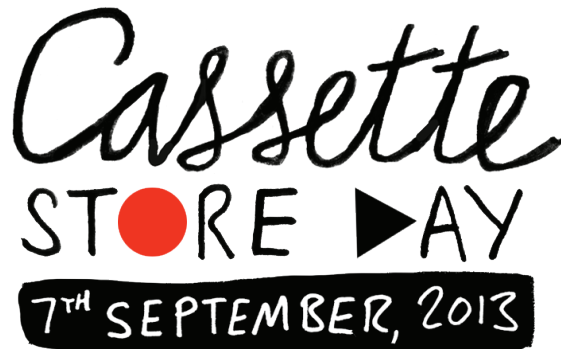
Figure 5: Cassette Store Day: 2013 twist on Record Store Day.

No doubt, there is a great deal of overlap between on one hand post-digital mimeograph printmaking, audio cassette production, mechanical typewriter experimentation and vinyl DJing, and on the other hand various hipster-retro media trends — including digital simulations of analog lo-fi in popular smartphone apps such as Instagram, Hipstamatic and iSupr8. But there is a qualitative difference between simply using superficial and stereotypical ready-made effects, and the