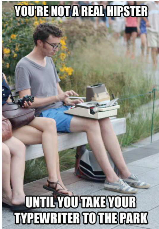
Figure 1: “You’re not a real hipster – until you take your typewriter to the park.”

In January 2013, a picture of a young man typing on a mechanical typewriter while sitting on a park bench went ‘viral’ on the popular website Reddit. The image was presented in the typical style of an ‘image macro’ or ‘imageboard meme’ (Klok 16-19), with a sarcastic caption in bold white Impact typeface that read: “You’re not a real hipster — until you take your typewriter to the park”.