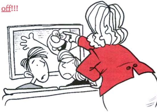
Switch it off!