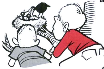
Breakfast in bed!